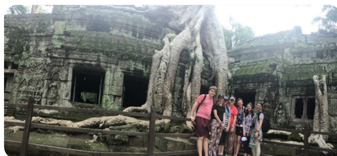
Ta Prohm Temple in Siem Reap