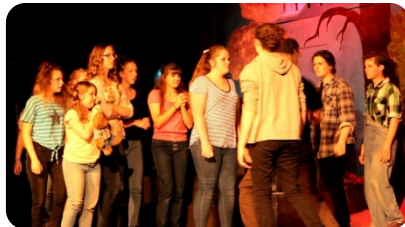
Better Part of Me