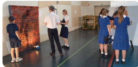
SH Visual Art Show