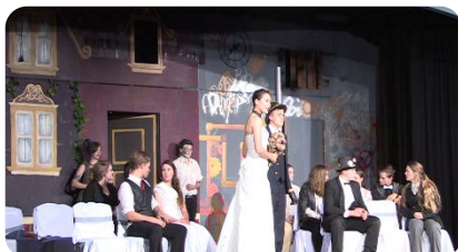
Taming of the Shrew