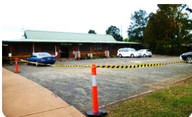
BEFORE construction it was a car park

The school has completed the new High School classroom block in readiness for Year 7 moving into High School in 2015. The school took possession of its new High School classroom and administration block at the beginning of the year. The total cost of $850,000 was supported by a $500,000 grant from Queensland State Government.