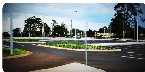
New Car Park AFTER Construction