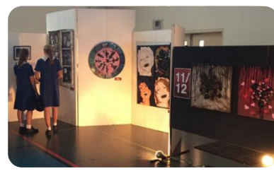
SH Visual Art Show