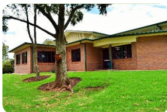
AFTER New High School Building