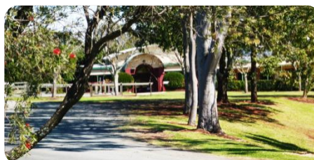
Car Park Area BEFORE Construction