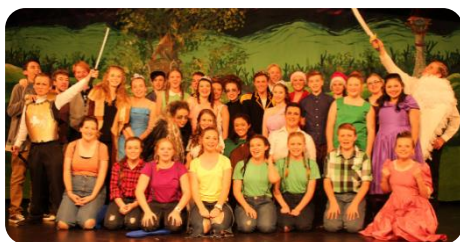
Forgiven: a Fairv Tale