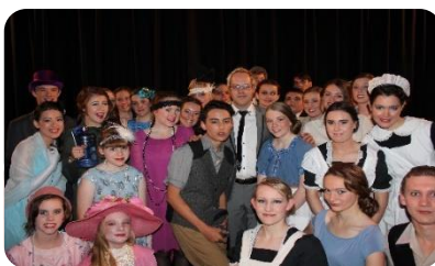
Mv Fair Ladies Colleae