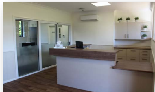
New Primary Administration

Building 2 was remodelled to accommodate Primary Administration.