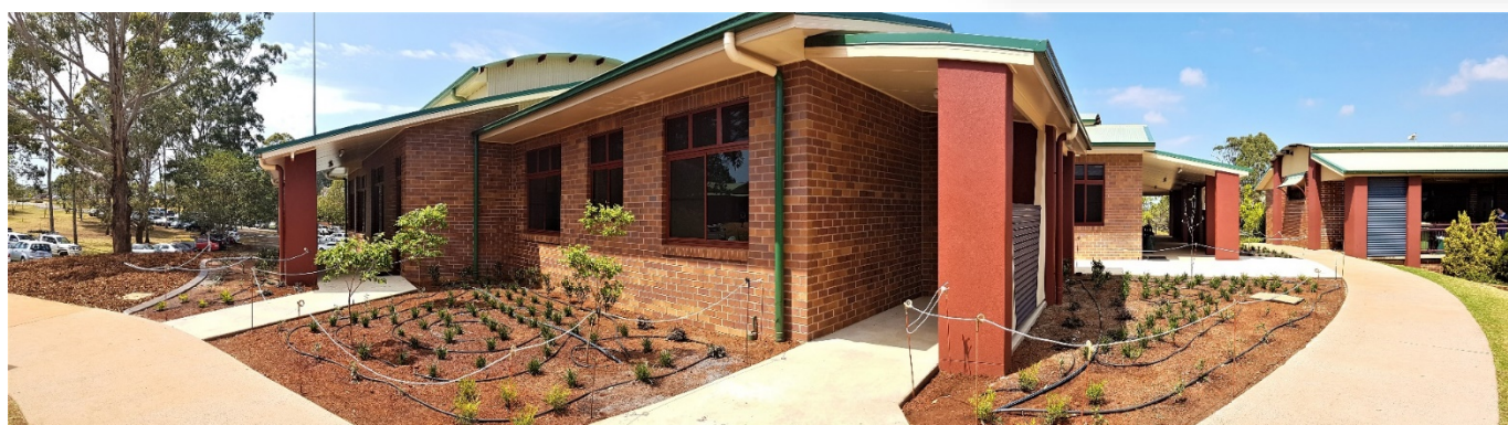
New High School Classroom Block

A new building containing five classrooms, a larger classroom for drama, an office space and lots of space for lockers was constructed during 2017.