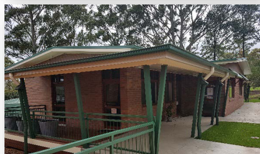
New Primary Music & Arts Building

A new facility for primary students was constructed for Performing Music and Drama classes.