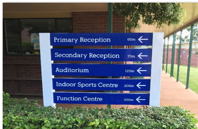
One of the new signs installed

The school has positioned new signs around the school to help direct parents and visitors to important locations.