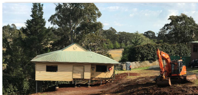
The Woodwork Building in its new position on the hill

In August, the School Board and leaders of Toowoomba City Church approved the funding of the new Technology Building. This new facility will be built where the Woodwork Building once sat, and will be a facility to house Graphics, Woodwork, Robotics and Mechatronics classes. Construction commenced in Term Four and is expected to be completed in April 2019.