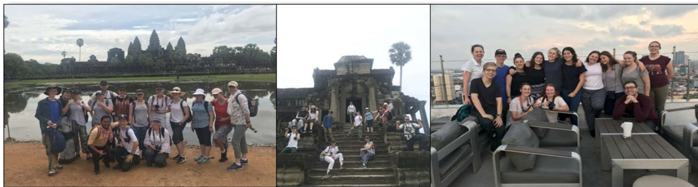
The 2018 TCC Mission Trip team visiting Cambodia