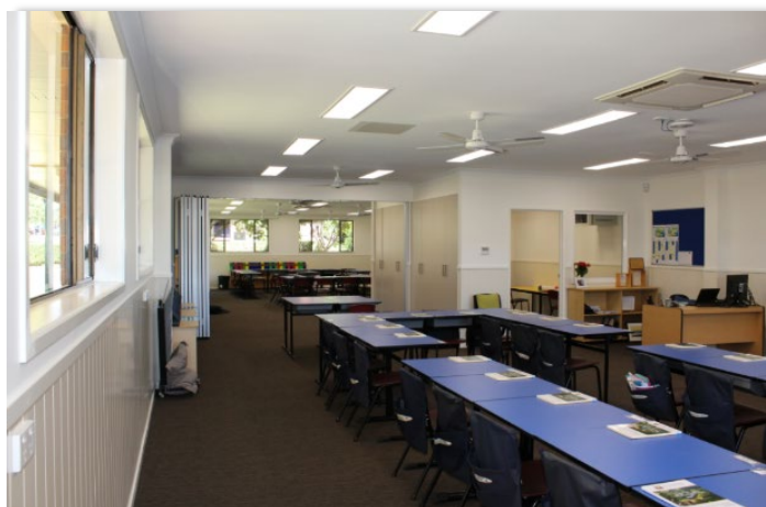
The newly renovated Year 6 Classrooms

Over the Christmas school holidays, the renovation of the Year 6 classrooms was completed.