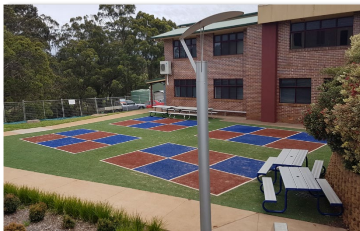
New synthetic handball courts