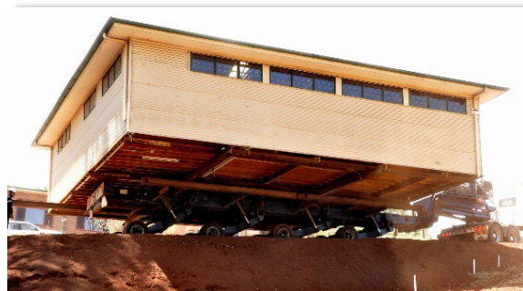
The Woodwork Building being relocated

During the September school holidays, the Woodwork building was moved from its original site and relocated about 30m further away. Once the new Technology Building is completed, the old Woodwork building will become the High School Art Facility.