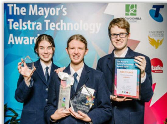
The winners of the 2018 Mayor's Telstra Technology Award